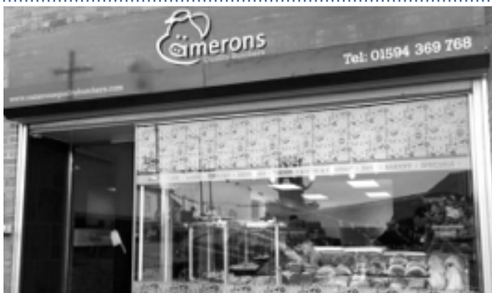
Door handle for the new Camerons shop on the Triangle.

Thanks to Camerons for their ongoing support of News & Views and for providing delicious meat for BBQ's and BoB events at a very reasonable cost.