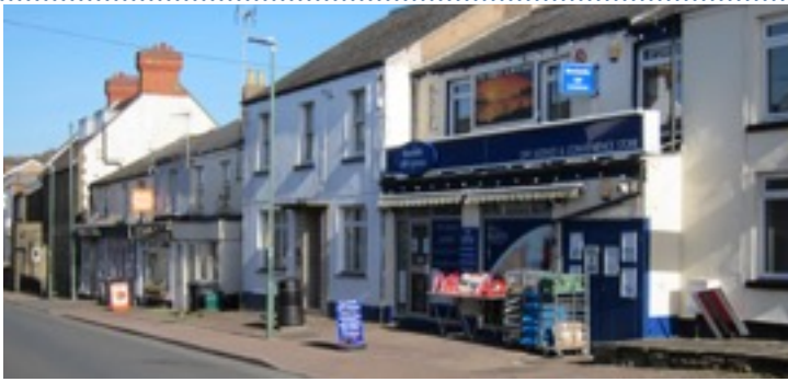
"The Forest is Defended" Mural, Commercial Street, Cinderford