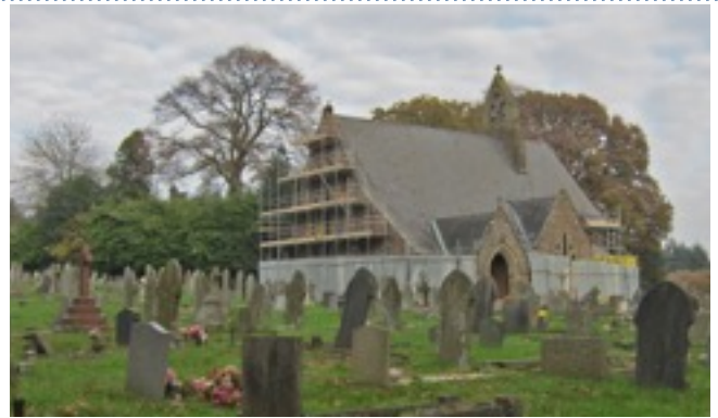
All Saints Church, Viney Hill. Currently under repair.

On Sun 14 January - Messy Church at St Stephen's from 3 pm - 5 pm