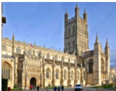
Gloucester Cathedral originated in 678 or 679 with the foundation of an abbey dedicated to St Peter.