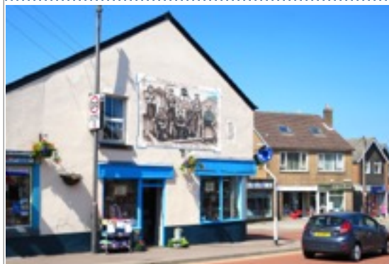
Over the top of Ripping Yarns shop in Belle Vue Road.